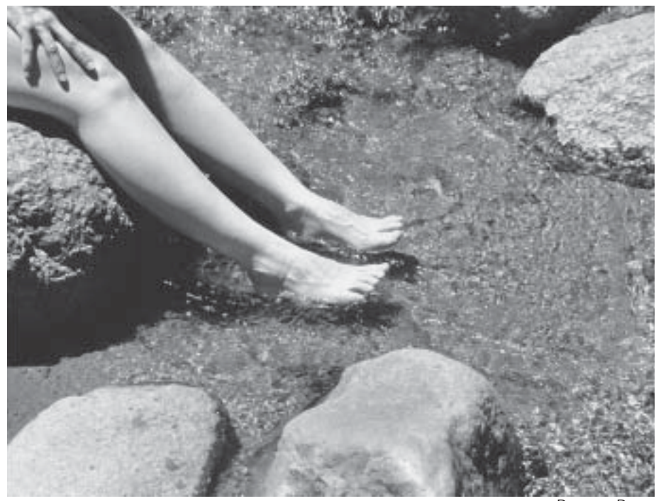
"...we note with joy the renewed zeal for the presence of the Spirit. . . We know that if this renewed presence can mature into a convergence with the thirst for justice, a new Pentecost will truly be upon us." Page 33