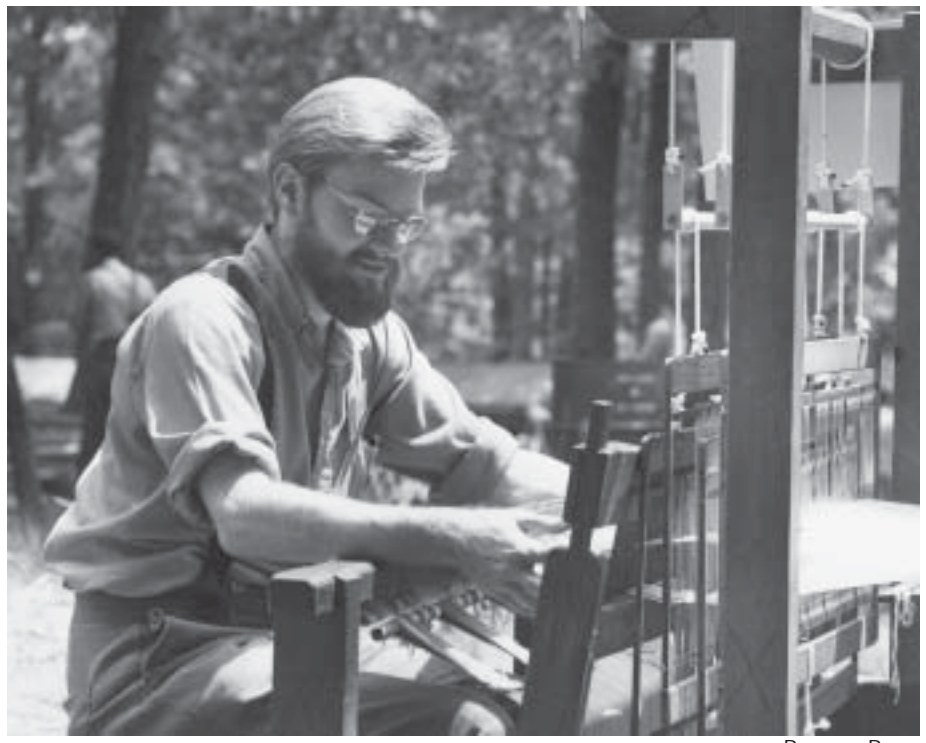
"The authentic goals of all technologies need to serve the human community, cherish the ecosystem, and give glory to the Creator." Page 88